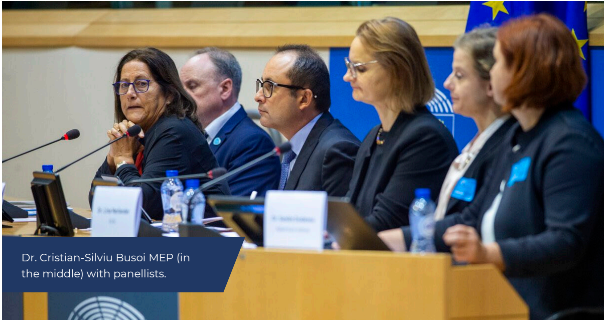
Dr. Cristian-Silviu Busoi MEP (in the middle) with panellists.

amongst those who are likely to benefit most from vaccination, i.e. in the case of the young people. The best way to achieve this is to promote gender neutral vaccination so that all sections of the